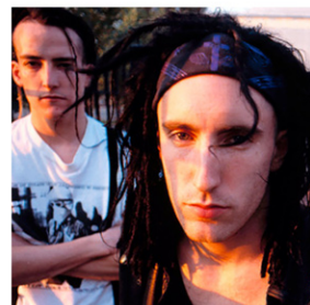
Nine Inch Nails