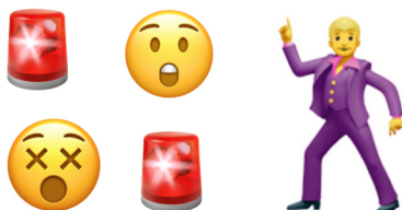
Panic! At The Disco