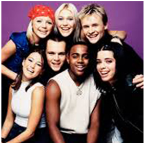
S Club 7