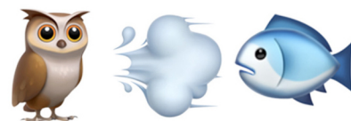
Hootie & The Blowfish